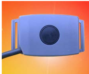
GE/Corometrics 2260 116,118,120 Series, 150/170 Series