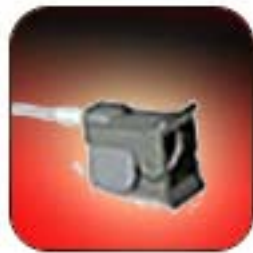
Paediatric Finger Clip