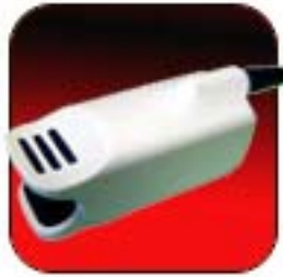
Adult finger clip