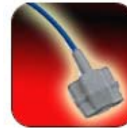
Rubber boot (child)