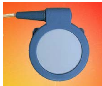
HP/Philips Ultrasound M1356A 1350A, 50XM