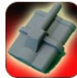
Rubber boot (adult)