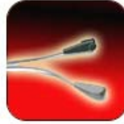
Multi-site Y of ear clip