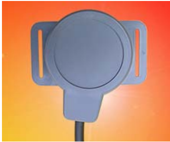
GE/Corometrics 7500 116,118,120 Series, 150/170 Series