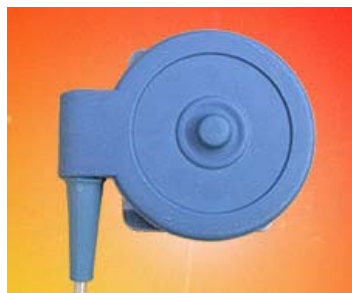
HP/Philips Toco M1355A 1350A, 50XM