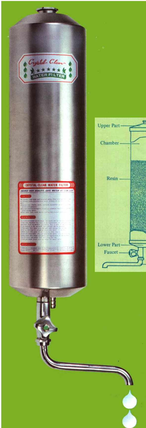
Crystal Clear Water Filter