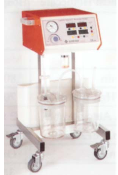
DF700 Mini ENT Treatment Unit